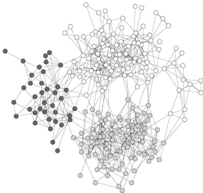
Figure 1 Friendship clusters in a US school. Reprinted with permission from Moody J. Peer influence groups: identifying dense clusters in large networks. Soc Netw 2001;23:261–83.

Nodes in a network might be thought to be randomly related, each with a similar number of connections. However, most networks are actually “scale-free,” with unequally distributed nodes with varying numbers of connections. 34–36 A few nodes with many connections form “hubs” which emerge naturally and become the distributed force field of the network (for example, the Google search engine, King’s Cross station or a prominent, influential clinician). Scale-free networks are less likely to become congested because they concentrate effort efficiently. 37 The internet has such a structure, with a limited